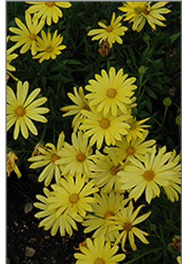
Voltage Yellow African Daisy flowers