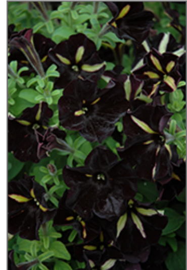
Phantom Petunia flowers