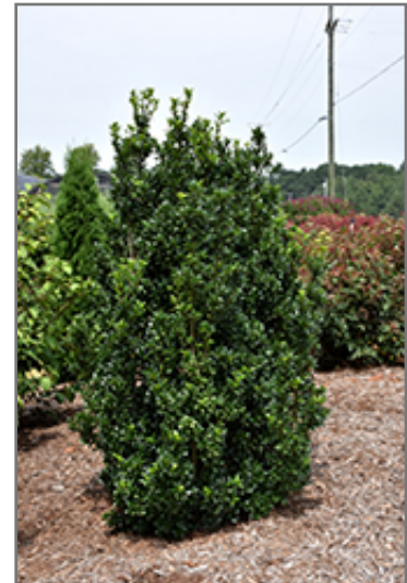
Castle Wall Meserve Holly

Castle Wall Meserve Holly is recommended for the following landscape applications;