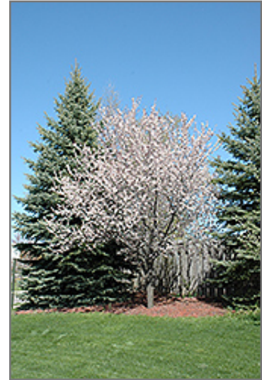
Newport Plum in bloom

This tree should only be grown in full sunlight. It does best in average to evenly moist conditions, but will not tolerate standing water. It is not particular as to soil type or pH. It is highly tolerant of urban pollution and will even thrive in inner city environments. This is a selected variety of a species not originally from North America.