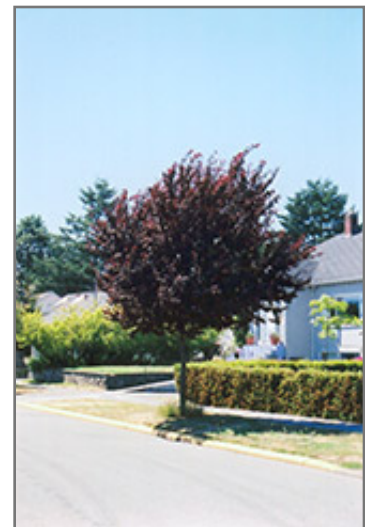
Newport Plum