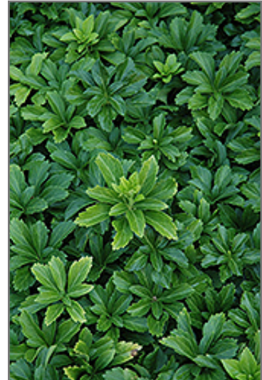
Green Sheen Japanese Spurge foliage