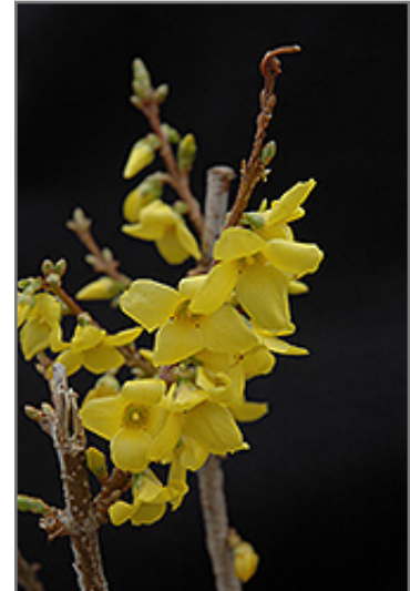
Show Off Forsythia flowers

Show Off Forsythia makes a fine choice for the outdoor landscape, but it is also well-suited for use in outdoor pots and containers. With its upright habit of growth, it is best suited for use as a 'thriller' in the 'spiller-thriller-filler' container combination; plant it near the center of the pot, surrounded by smaller plants and those that spill over the edges. It is even sizeable enough that it can be grown alone in a suitable container. Note that when grown in a container, it may not perform exactly as indicated on the tag - this is to be expected. Also note that when growing plants in outdoor containers and baskets, they may require more frequent waterings than they would in the yard or garden.