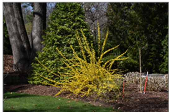
Show Off Forsythia in bloom