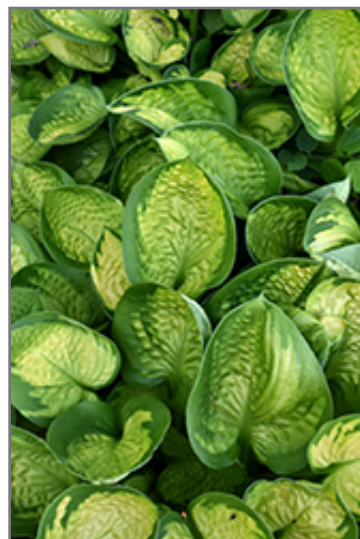
Rainforest Sunrise Hosta foliage