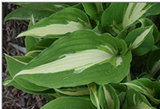
Night Before Christmas Hosta foliage

10300 E. 9000 N Road Grant Park, IL 60940 Phone: 1-815-465-6310 Fax: 1-815-465-6396