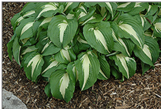
Night Before Christmas Hosta foliage

Night Before Christmas Hosta is recommended for the following landscape applications;