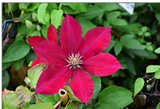
Rebecca Clematis flowers

10300 E. 9000 N Road Grant Park, IL 60940 Phone: 1-815-465-6310 Fax: 1-815-465-6396