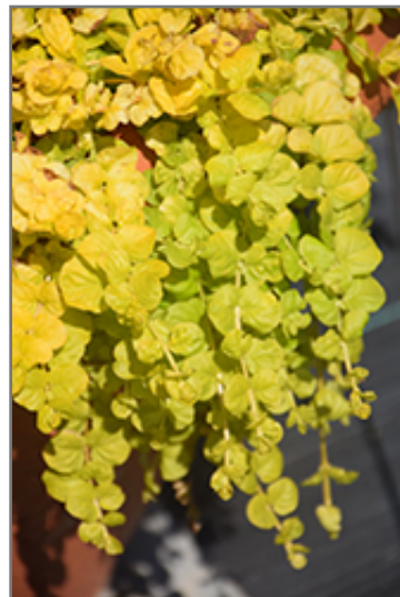
Goldilocks Creeping Jenny foliage