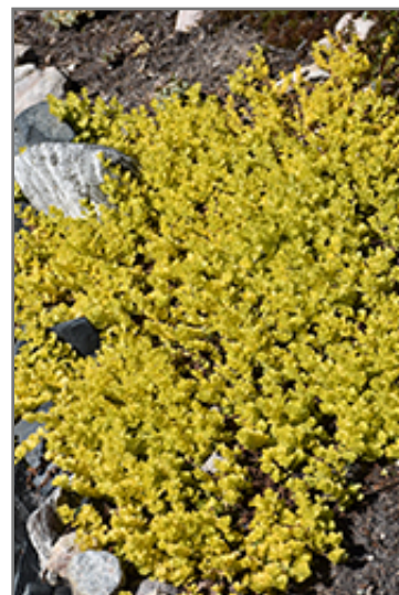
Goldilocks Creeping Jenny

Goldilocks Creeping Jenny will grow to be only 6 inches tall at maturity, with a spread of 3 feet. When grown in masses or used as a bedding plant, individual plants should be spaced approximately 24 inches apart. Its foliage tends to remain low and dense right to the ground. It grows at a fast rate, and under ideal conditions can be expected to live for approximately 10 years. As an herbaceous perennial, this plant will usually die back to the crown each winter, and will regrow from the base each spring. Be careful not to disturb the crown in late winter when it may not be readily seen!