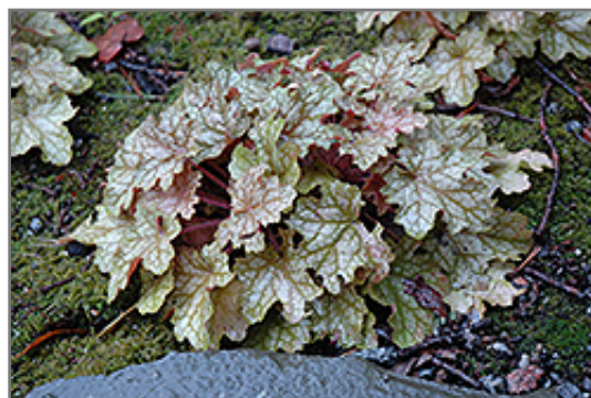
Ginger Ale Coral Bells

10300 E. 9000 N Road Grant Park, IL 60940 Phone: 1-815-465-6310 Fax: 1-815-465-6396