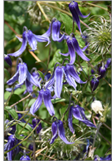
Solitary Clematis flowers