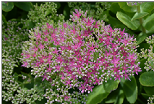
Neon Stonecrop flower buds