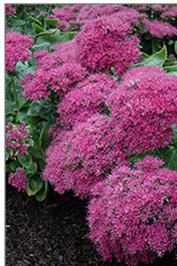
Neon Stonecrop flowers

Neon Stonecrop is a dense herbaceous perennial with an upright spreading habit of growth. Its relatively coarse texture can be used to stand it apart from other garden plants with finer foliage.