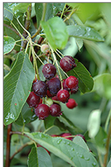
Regent Saskatoon fruit

Regent Saskatoon is blanketed in stunning clusters of white flowers rising above the foliage from early to mid spring before the leaves. It has dark green deciduous foliage. The oval leaves turn an outstanding yellow in the fall. It features an abundance of magnificent blue berries from late spring to early summer.