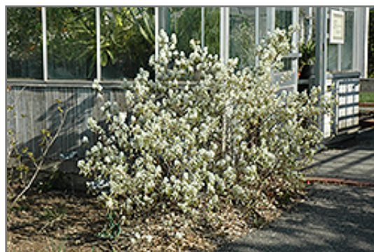
Regent Saskatoon flowers

10300 E. 9000 N Road Grant Park, IL 60940 Phone: 1-815-465-6310 Fax: 1-815-465-6396