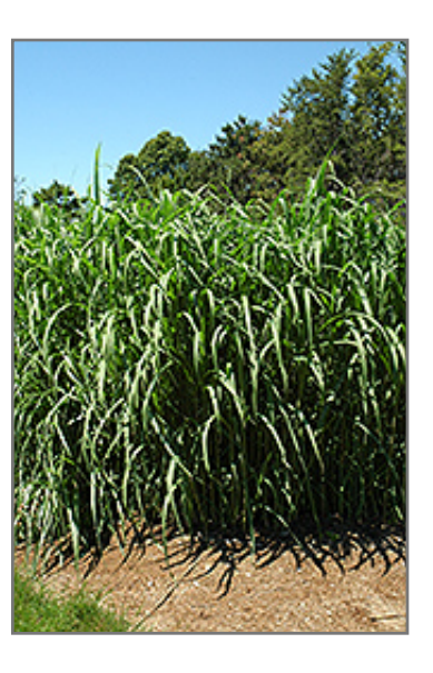
Giant Silver Grass