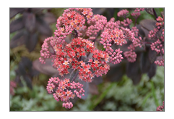
Night Embers Stonecrop flowers