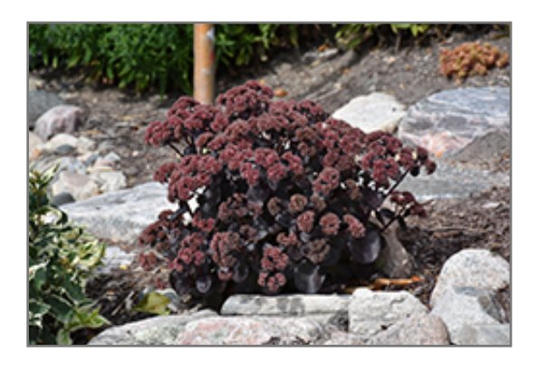
Night Embers Stonecrop in bloom

Night Embers Stonecrop is a dense herbaceous perennial with an upright spreading habit of growth. Its relatively coarse texture can be used to stand it apart from other garden plants with finer foliage.