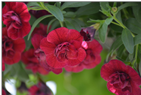
Superbells Double Ruby Calibrachoa flowers

Superbells Double Ruby Calibrachoa is recommended for the following landscape applications;