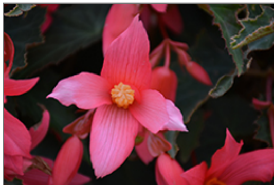
Bossa Nova Pink Glow Begonia flowers

This is a high maintenance plant that will require regular care and upkeep, and usually looks its best without pruning, although it will tolerate pruning. Deer don't particularly care for this plant and will usually leave it alone in favor of tastier treats. Gardeners should be aware of the following characteristic(s) that may warrant special consideration;