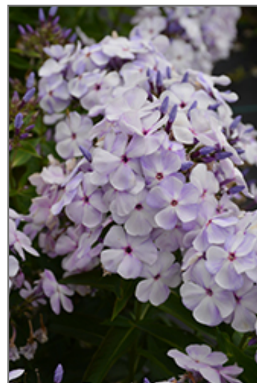
Flame Blue Garden Phlox flowers

This plant will require occasional maintenance and upkeep, and should be cut back in late fall in preparation for winter. It is a good choice for attracting butterflies and hummingbirds to your yard. Gardeners should be aware of the following characteristic(s) that may warrant special consideration;