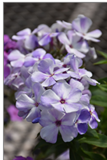
Flame Blue Garden Phlox flowers

Flame Blue Garden Phlox will grow to be about 12 inches tall at maturity extending to 16 inches tall with the flowers, with a spread of 20 inches. When grown in masses or used as a bedding plant, individual plants should be spaced approximately 16 inches apart. It grows at a medium rate, and under ideal conditions can be expected to live for approximately 10 years. As an herbaceous perennial, this plant will usually die back to the crown each winter, and will regrow from the base each spring. Be careful not to disturb the crown in late winter when it may not be readily seen!