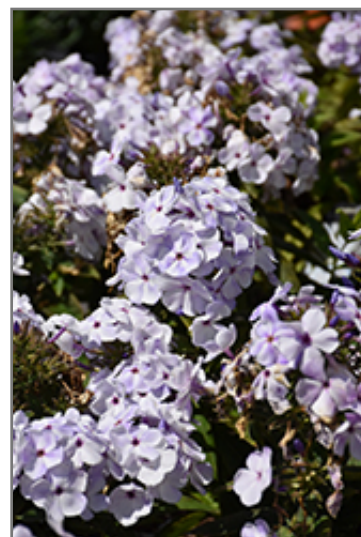
Flame Blue Garden Phlox flowers

10300 E. 9000 N Road Grant Park, IL 60940 Phone: 1-815-465-6310 Fax: 1-815-465-6396