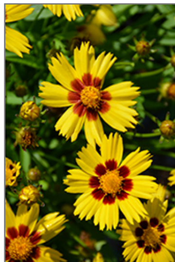
Sunkiss Tickseed flowers