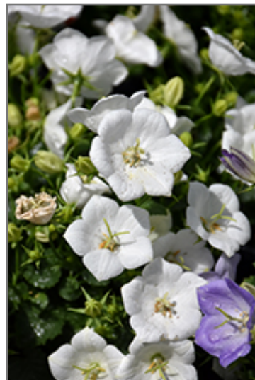
Rapido White Bellflower flowers

Rapido White Bellflower is recommended for the following landscape applications;