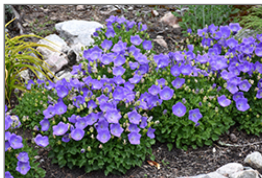
Rapido Blue Bellflower in bloom

10300 E. 9000 N Road Grant Park, IL 60940 Phone: 1-815-465-6310 Fax: 1-815-465-6396