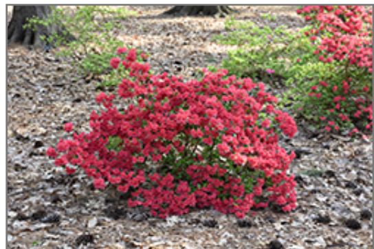
Girard's Crimson Azalea in bloom