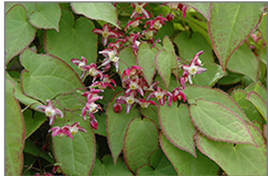
Bishop's Hat flowers

Bishop's Hat is recommended for the following landscape applications;