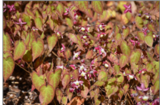
Bishop's Hat in bloom

Bishop's Hat will grow to be about 12 inches tall at maturity, with a spread of 18 inches. When grown in masses or used as a bedding plant, individual plants should be spaced approximately 15 inches apart. Its foliage tends to remain dense right to the ground, not requiring facer plants in front. It grows at a medium rate, and under ideal conditions can be expected to live for approximately 10 years.