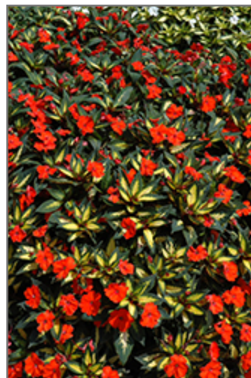
SunPatiens Spreading Tropical Orange New Guinea Impatiens flowers

SunPatiens Spreading Tropical Orange New Guinea Impatiens is a fine choice for the garden, but it is also a good selection for planting in outdoor containers and hanging baskets. It can be used either as 'filler' or as a 'thriller' in the 'spiller-thriller-filler' container combination, depending on the height and form of the other plants used in the container planting. It is even sizeable enough that it can be grown alone in a suitable container. Note that when growing plants in outdoor containers and baskets, they may require more frequent waterings than they would in the yard or garden.