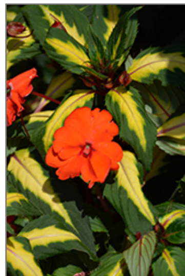
SunPatiens Spreading Tropical Orange New Guinea Impatiens flowers

This plant will require occasional maintenance and upkeep, and should not require much pruning, except when necessary, such as to remove dieback. It has no significant negative characteristics.