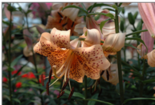
Splendens Tiger Lily flowers

Splendens Tiger Lily is recommended for the following landscape applications;