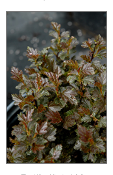
Tiny Wine Ninebark foliage