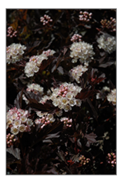
Tiny Wine Ninebark flowers

This shrub will require occasional maintenance and upkeep, and can be pruned at anytime. It has no significant negative characteristics.