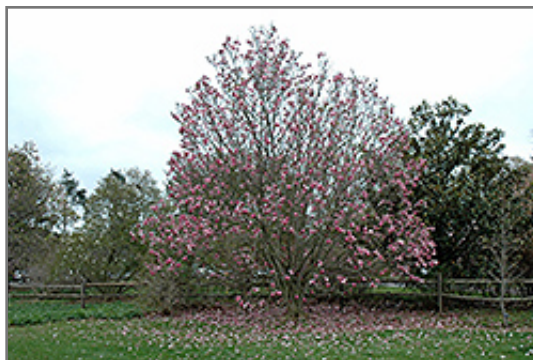
Galaxy Magnolia in bloom

10300 E. 9000 N Road Grant Park, IL 60940 Phone: 1-815-465-6310 Fax: 1-815-465-6396