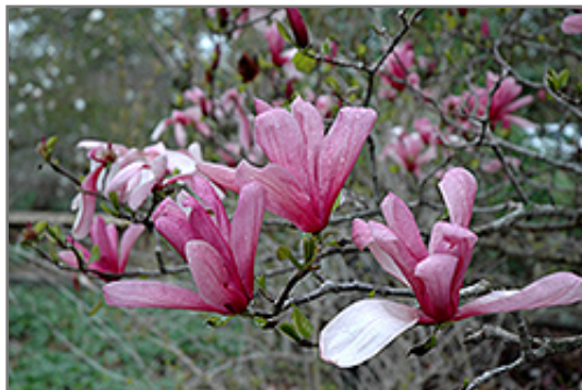
Galaxy Magnolia flowers