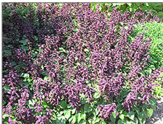
Vista Purple Sage in bloom

10300 E. 9000 N Road Grant Park, IL 60940 Phone: 1-815-465-6310 Fax: 1-815-465-6396