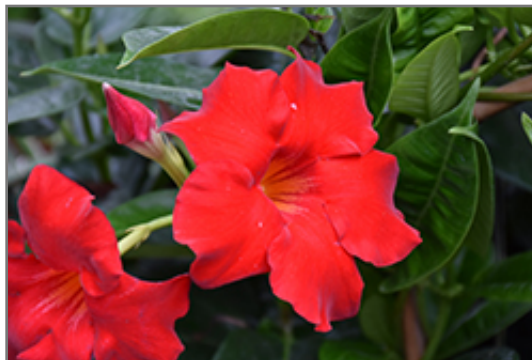
Red Mandevilla flowers

This plant does best in full sun to partial shade. It requires an evenly moist well-drained soil for optimal growth. It is not particular as to soil type or pH. It is highly tolerant of urban pollution and will even thrive in inner city environments. This particular variety is an interspecific hybrid, and parts of it are known to be toxic to humans and animals, so care should be exercised in planting it around children and pets. It can be propagated by cuttings; however, as a cultivated variety, be aware that it may be subject to certain restrictions or prohibitions on propagation.