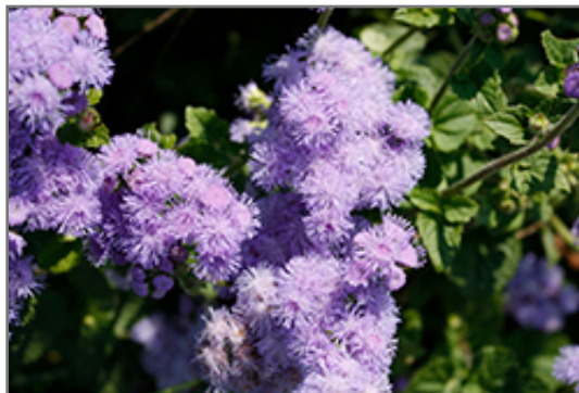
Blue Horizon Flossflower flowers

This plant will require occasional maintenance and upkeep. Trim off the flower heads after they fade and die to encourage more blooms late into the season. It is a good choice for attracting butterflies to your yard, but is not particularly attractive to deer who tend to leave it alone in favor of tastier treats. It has no significant negative characteristics.