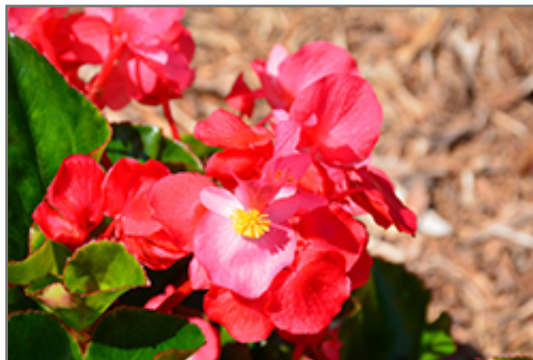
Whopper Rose Green Leaf Begonia flowers

Whopper Rose Green Leaf Begonia is an herbaceous annual with a mounded form. Its medium texture blends into the garden, but can always be balanced by a couple of finer or coarser plants for an effective composition.