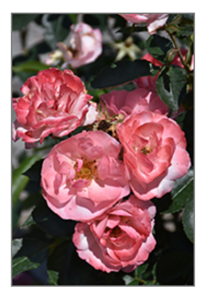
Calypso Rose flowers (faded)

HOURS OF OPERATION: Monday – Friday 8 am - 6 pm Saturday 8 am - 5 pm Sunday Closed