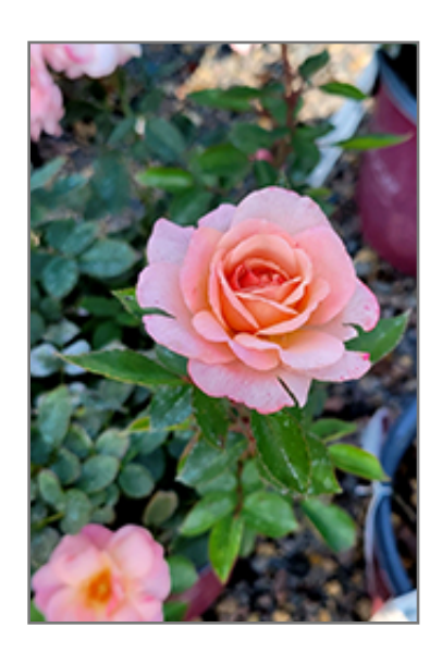
Calypso Rose flowers