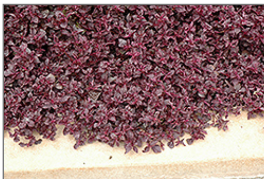
Purple Lady Blood Leaf

10300 E. 9000 N Road Grant Park, IL 60940 Phone: 1-815-465-6310 Fax: 1-815-465-6396