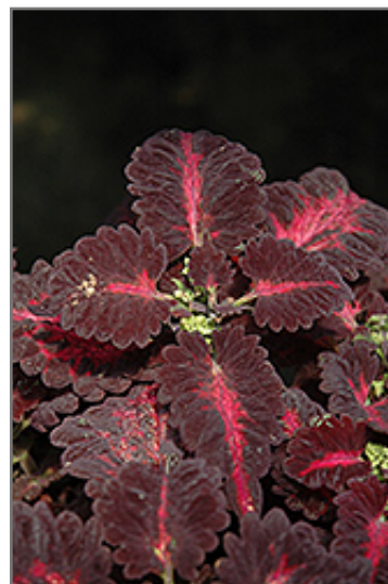
Black Dragon Coleus foliage