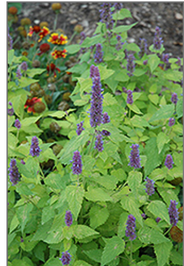
Golden Jubilee Anise Hyssop flowers

Golden Jubilee Anise Hyssop is recommended for the following landscape applications;