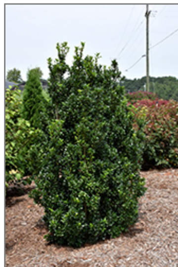
Castle Wall Meserve Holly

Castle Wall Meserve Holly is recommended for the following landscape applications;