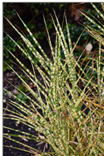
Gold Breeze Maiden Grass foliage

Gold Breeze Maiden Grass is recommended for the following landscape applications;