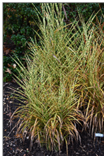
Gold Breeze Maiden Grass

10300 E. 9000 N Road Grant Park, IL 60940 Phone: 1-815-465-6310 Fax: 1-815-465-6396